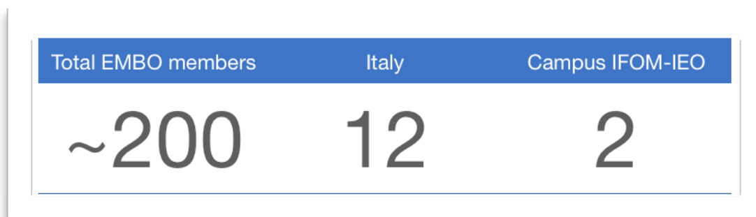
Fig. 4: Young EMBO members in Italy and at the Campus IFOM-IEO