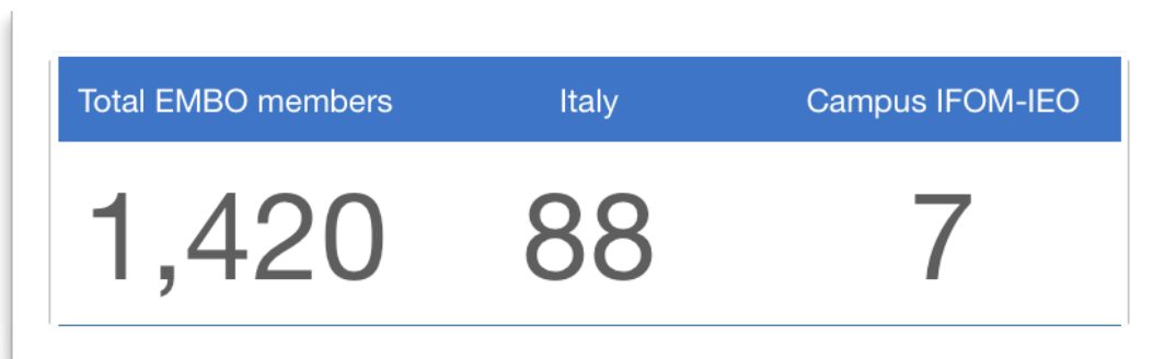
Fig. 3: EMBO members in Italy and at the Campus IFOM-IEO.

To achieve these results, the Campus IFOM-IEO has been able to create a thriving work environment with first-class researchers as shown by the number of EMBO members working at the Campus (figg. 3,4). Moreover, two IFOM senior researchers are also members of Cell's editorial board.